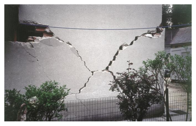
Figure 2: Typical damage caused to houses in the town of Bovec during the 1998 earthquake.

With the 1998 earthquake (April 12<sup>th</sup>; M 5.6; Figure 2), it turned out that the reconstruction and reinforcement of buildings after the 1976 earthquakes (May 6<sup>th</sup>; M 6.5; September 15<sup>th</sup>; M 6.1) had often been poor or incomplete. After the 2004 earthquake (July 12<sup>th</sup>; M 4.9), a similar deficiency was established regarding recovery following the 1998 earthquake [12]. This happened even though recovery after the 1998 earthquake had to be "managed uniformly and based on equal principles regarding all affected parties" and with the goal "to reconstruct structures in a professional and sustainable manner, and to reinforce them to be able to sustain an earthquake at least one magnitude higher than that of the earthquake of April 12<sup>th</sup>, 1998" [13, p. 301] and even though a special law, the Post-Earthquake Reconstruction of Structures and Development Promotion in the Soča Valley Act [14], had been adopted. At the end of 2001, those in charge already boasted about "successful post-earthquake recovery" [13, p. 303].