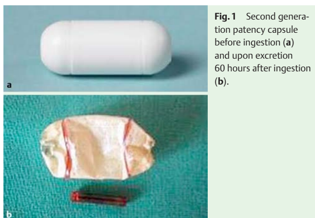
Fig. 1 Second generation patency capsule before ingestion (a) and upon excretion 60 hours after ingestion (b).

the patency capsule in the small bowel by plain abdominal film (XR), computed tomography (CT), or HHS within or after the defined excretion time.