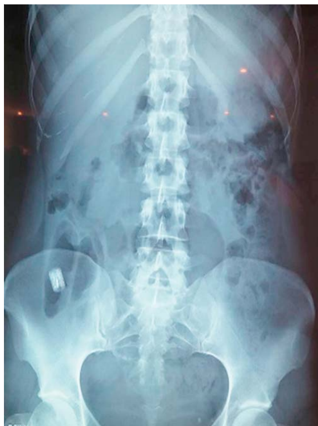
Fig. 2 Plain abdominal X-ray: patency capsule in the right iliac fossa.

The symptoms resolved spontaneously within up to 72 hours in 13 (65%) patients. Five (20%) patients were treated with systemic corticosteroids with subsequent resolution within up to 1 week. One patient required ileocecal resection and in another, the patency capsule, which was retained in the esophagus due to a Schatzki ring, was advanced to the duodenum endoscopically. This patient underwent diagnostic SBCE (introduced endoscopically) that was normal and uneventful.