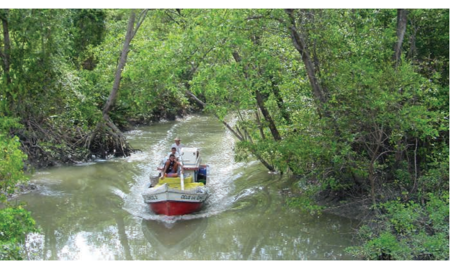
Emerging from the embrace of a mangrove tree-lined channel in northern Brazil, these pescadores, like coastal fishers worldwide, know that healthy mangroves mean good fishing and a secure livelihood.

Mangrove forests once covered more than 200,000 km<sup>2</sup> of sheltered tropical and subtropical coastlines (1). They are disappearing worldwide by 1 to 2% per year, a rate greater than or equal to declines in adjacent coral reefs or tropical rainforests (2-5). Losses are occur-