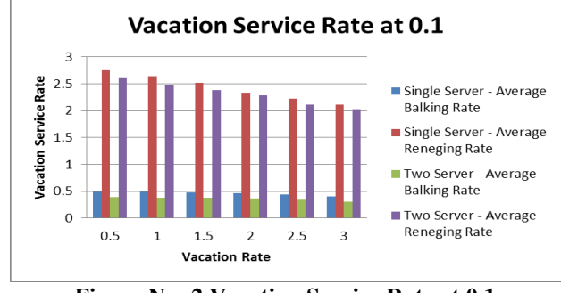
Figure No: 2 Vacation Service Rate at 0.1

Table No: 1 Vacation Service Rate at 0.1